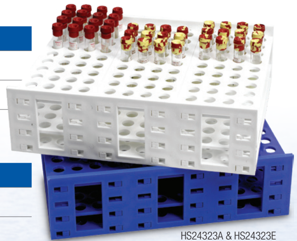
HS24323A & HS24323E